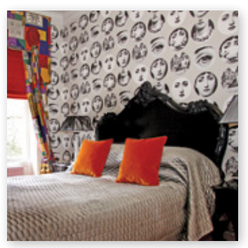
Cipriani Palace, Venice