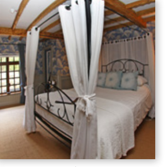
Le Touessrok, Mauritius